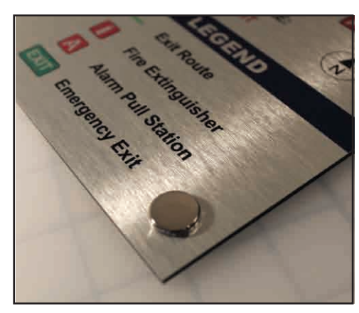
Decorative screw cap hardware